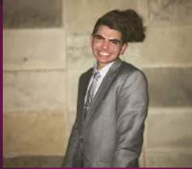
Sam Saba Governor