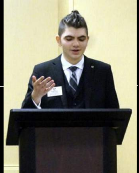
Letter from the Governor